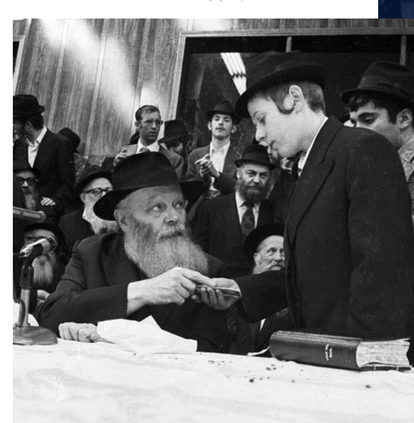
THE REBBE DISTRIBUTES DOLLARS TO THE 'TANKISTIN' AT THE CONCLUSION OF THE "FAREWELL" FARBRENGEN, 30 TISHREI 5736.

So too, we must keep up a healthy connection with our "head"—the Rebbe, ensuring that we have the proper chayus to do our avodah . Our hiskashrus