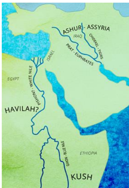
The Four Rivers

that flowed from Eden to the Garden, which watered all the plants and trees in the Garden. After this river passed through the Garden, it submerged underground and resurfaced as four different rivers. 8