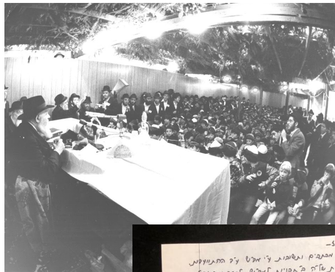
Above: At the Farbrengen for children in the Sukka.

הנ"ל השיב בחיוב, ואמר כ"ק אדמו"ר שליט"א: "אייגענע ספרים, ניט פון אנדערע נאר פון אייגענע. זאל זיין בשורות טובות".