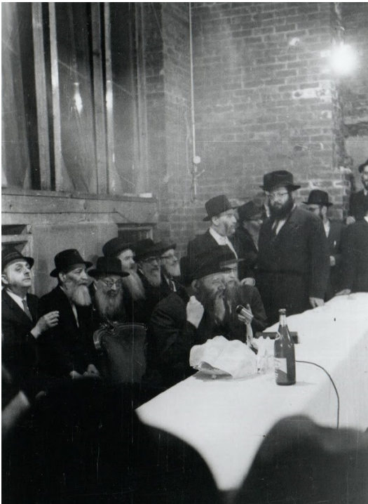
The Farbrengen of Lag B'omer 5722, during which the Rebbe began singing “Hoshiah” on his own

It seems likely that the “Double Bracha” that the Rebbe was referring to when he asked the guests from Eretz Yisroel to sing the Niggun, was for a “Yeshuah” of Russian Jewry.