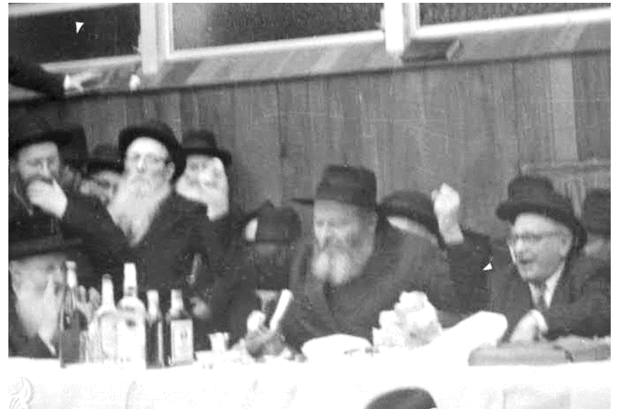
The Farbrengen of Purim 5724, during which the Rebbe sang “Hoshiah... V’Rachem”