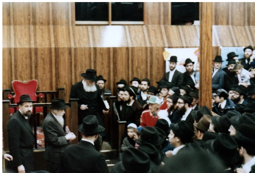
At the conclusion of the Rally on Chanukah 5739, the Rebbe exits the Shul as the children sing "Hoshiah"

It was very rare for the Rebbe to end off a Sichah with a Niggun, especially in the later years and it seems that this was also the last time that the Rebbe sang a full niggun at a Sichah or Farbrengen.