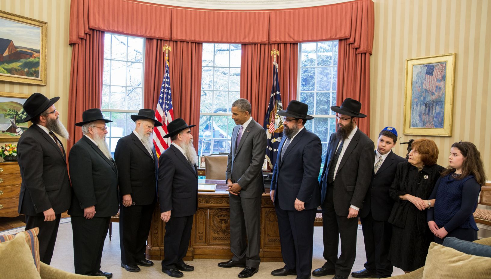
President Barack Obama with a delegation of Chabad-Lubavitch emissaries and educators. March 2015.