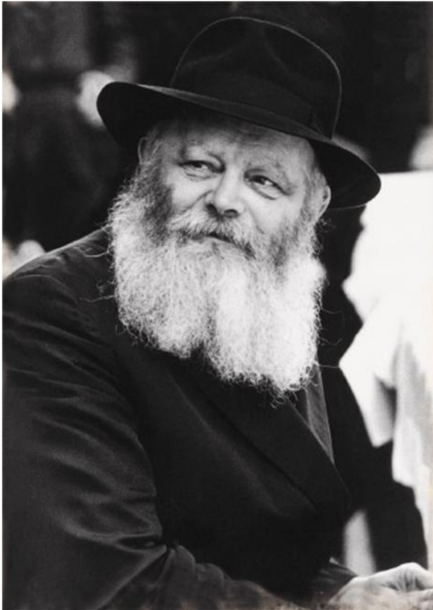
The Rebbe Rabbi Menachem M. Schneerson