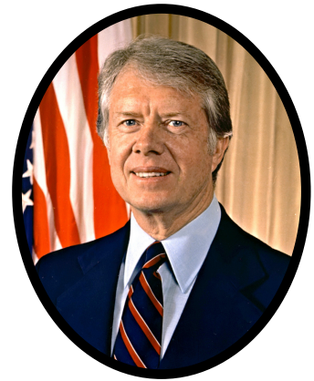
President Jimmy Carter 1978

"The Congress recognizes a need for the Nation to set aside on the calendar a day devoted to the importance of education to the lives of its citizens and to the general well-being of the Nation; [world] Jewry marked in 1977 the seventy-fifth birthday of the revered and renowned Jewish leader, the head of the worldwide Lubavitch Movement, Rabbi Menachem Mendel Schneerson. . . I am delighted that "Education Day - U.S.A." falls on your birthday. It is a most fitting coincidence and I would like to take this opportunity of extending to you my personal best wishes for many more years of good health and fruitful work."