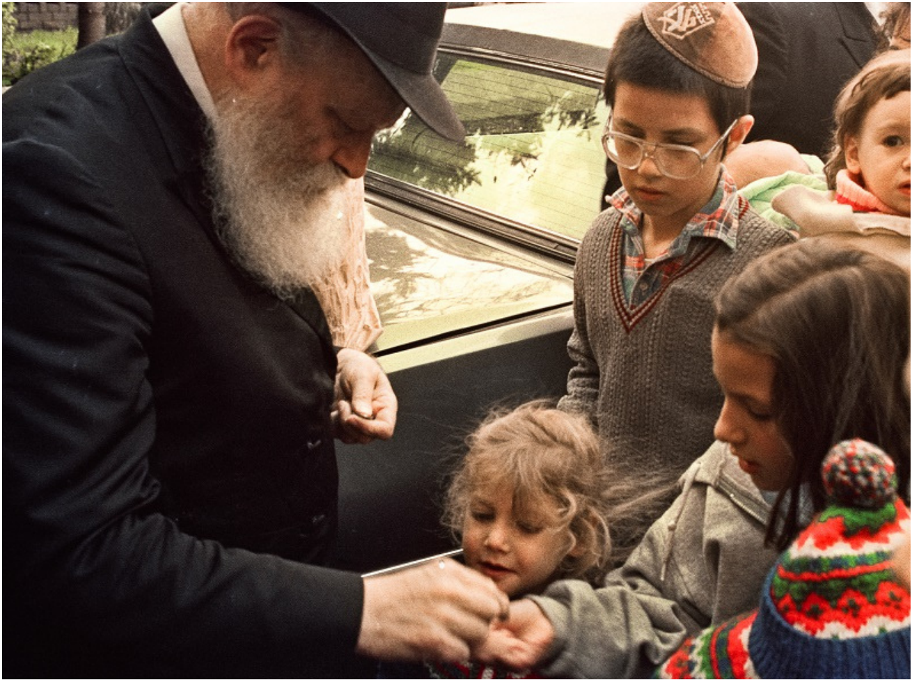
The Rebbe gives children coins to give to charity

Since 1978, Education Day, U.S.A. has become an annual national event, spearheaded each year with a new proclamation by the president calling on all Americans to increase energy and dedication to the education of their youth. This important date has also been instituted at the local city, county and state level across the country, with many mayors and the governors of all 50 states calling on their citizens to do the same.