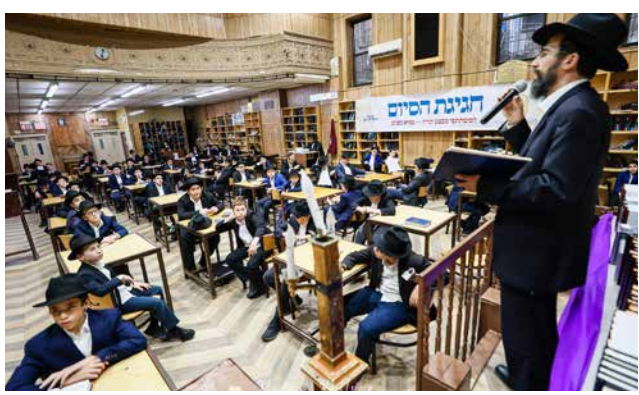
Grand prize event