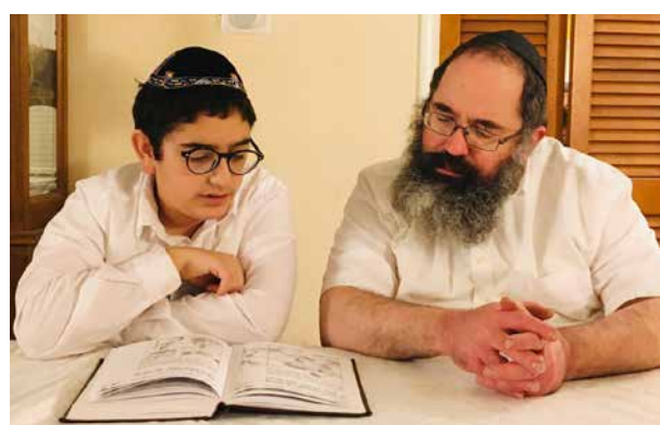
The program in action!