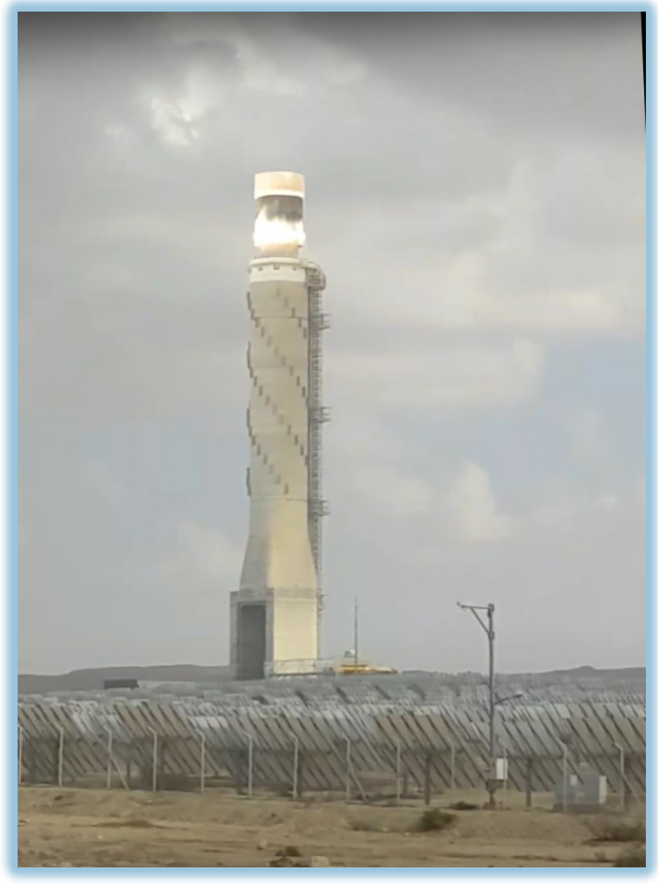
24-62 – There is no clear location of where Be'er LaChai Ro'i is located. In Bereshis 16:14, it says that it is between the cities of Kadesh and Bered . The above Ashalim power station (about 20 miles south of Be'er Sheva), is located near Bered . It had the tallest solar power tower in the world at a height of 260 meters.