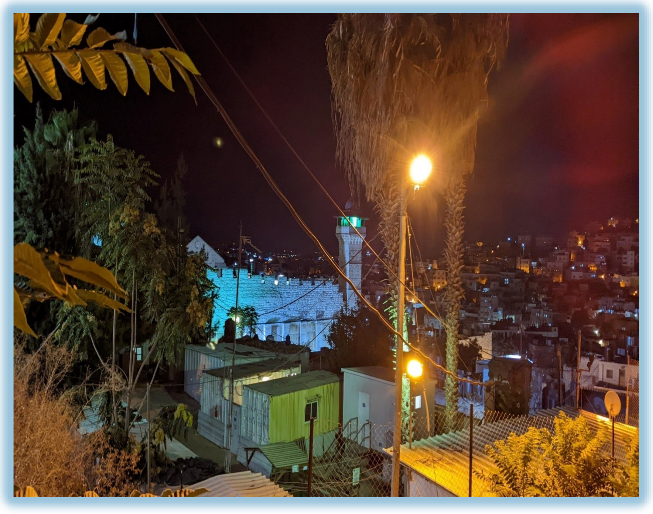
23-17 – View of Meoras Hamachpela from the Arab quarter. This entire area was purchased by Avraham Avinu.