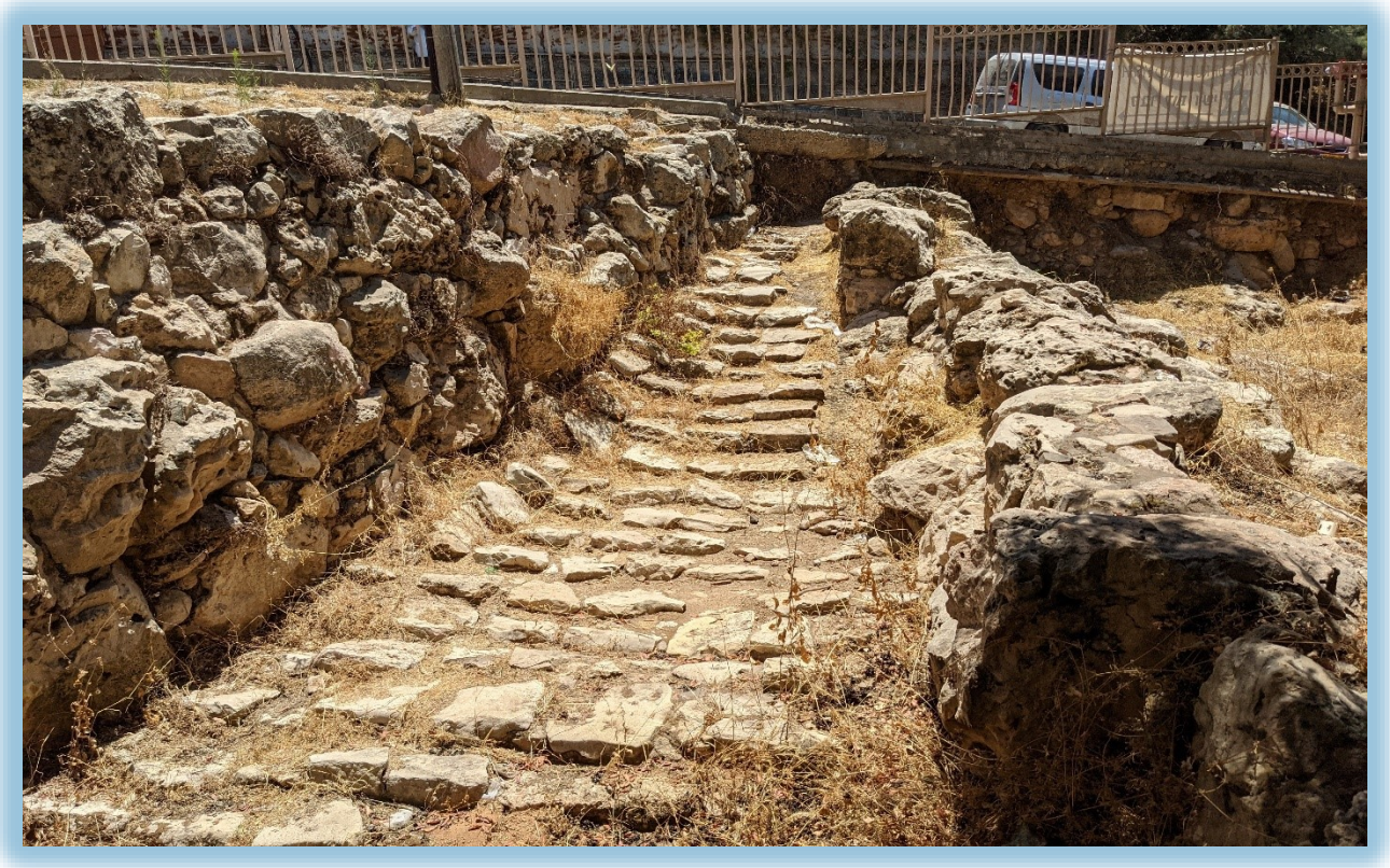
23-3 - The entrance to the ancient City of Chevron (about 17 miles southwest of Yerushalayim). This entrance is about 700 years older than Avraham Avinu. It is likely that Avraham Avinu walked on these stairs in order to talk to the Bnei Chais.