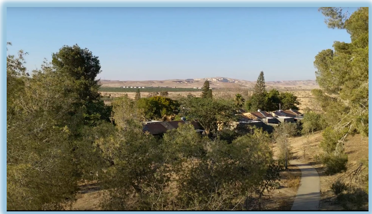
24:63 – View from an agriculture Kibbutz, Mashabei Sadeh (About 16 miles south of Be'er Sheva). Mashabei Sadeh is near Bered, on the way to Be'er LaChai Ro'i. The picture below was taken Mincha time Erev Shabbos.