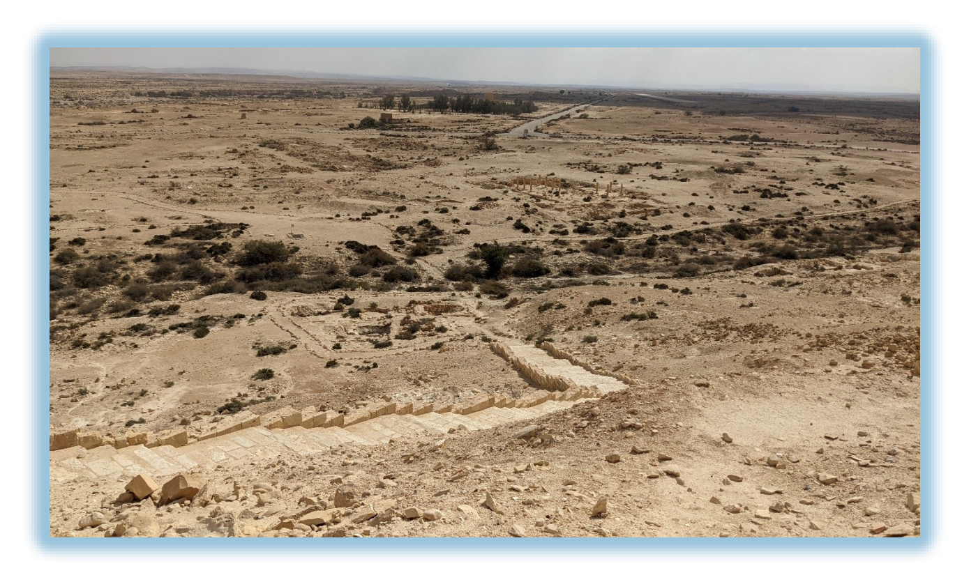
25-11 – View from the ancient fort of Nitzana (about 30 miles south of Rafah), which overlooks the approximate area of Be'er LaChai Ro'i.