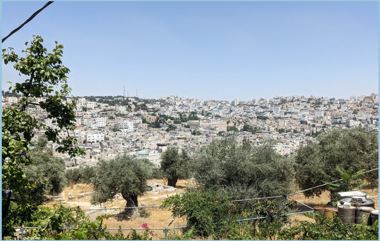
13:18 – The City of Chevron (about 17 miles southwest of Yerushalayim), Meoras Hamachpela is in the center of the picture. To the left of the picture, further past the hill, is Elonei Mamre.