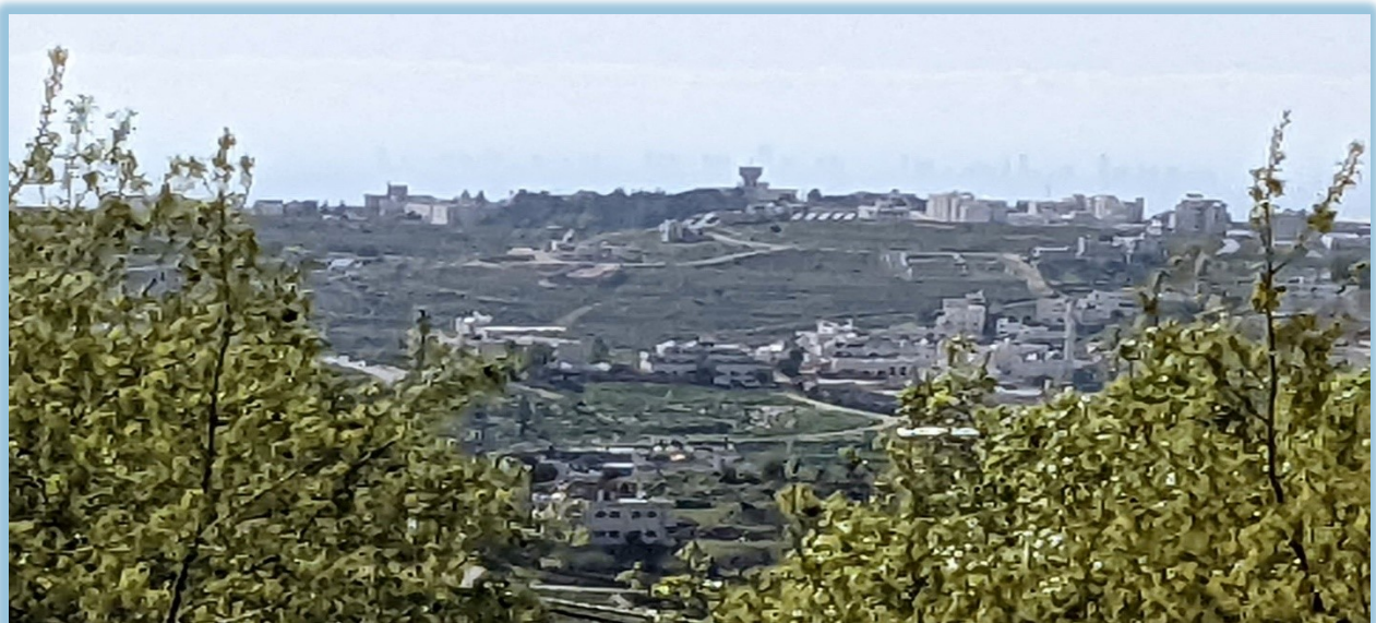
13:14/15 - View from the observation deck in Beit El (about 11 miles north of Yerushalayim). This is approximately the view that Avraham Avinu would have seen. South of Beit El is Ramallah, and after that is Yerushalayim. The bottom picture; on a clear day you can see the Tel Aviv area (the day I took this picture it was not very clear)