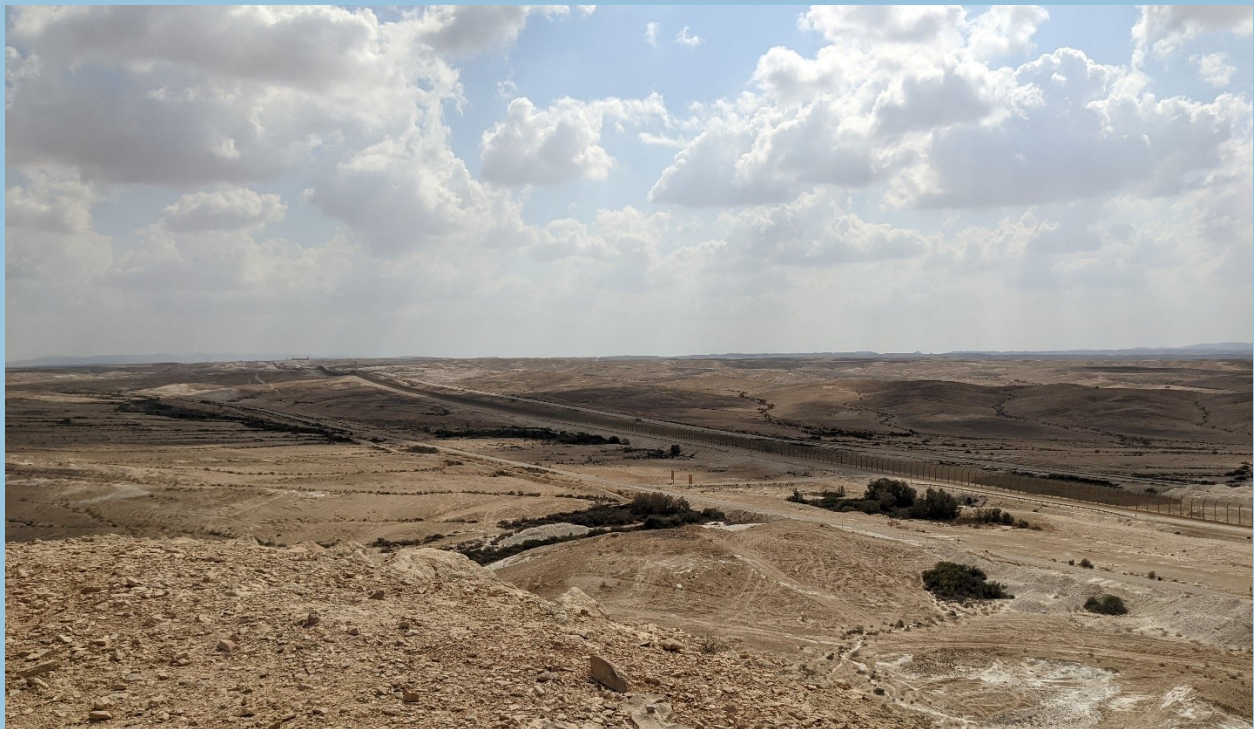
16:14 – View from the Egyptian border. Approximately 20 miles in that direction, across the border, is the city of Kadesh Barnea (this picture was taken about 25 miles south of Rafah)