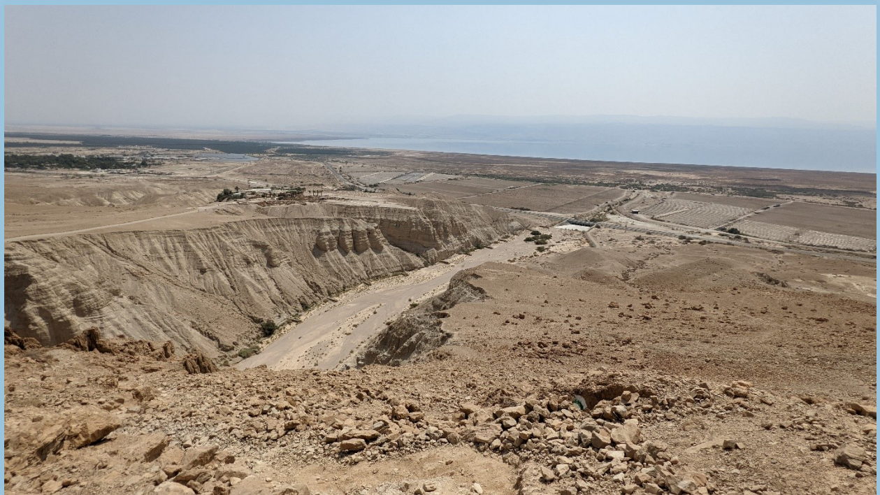
14:3 – View from Qumran (about 14 miles east of Yerushalayim, this is where the Dead Sea Scrolls were discovered) of the Yam Hamelach area.