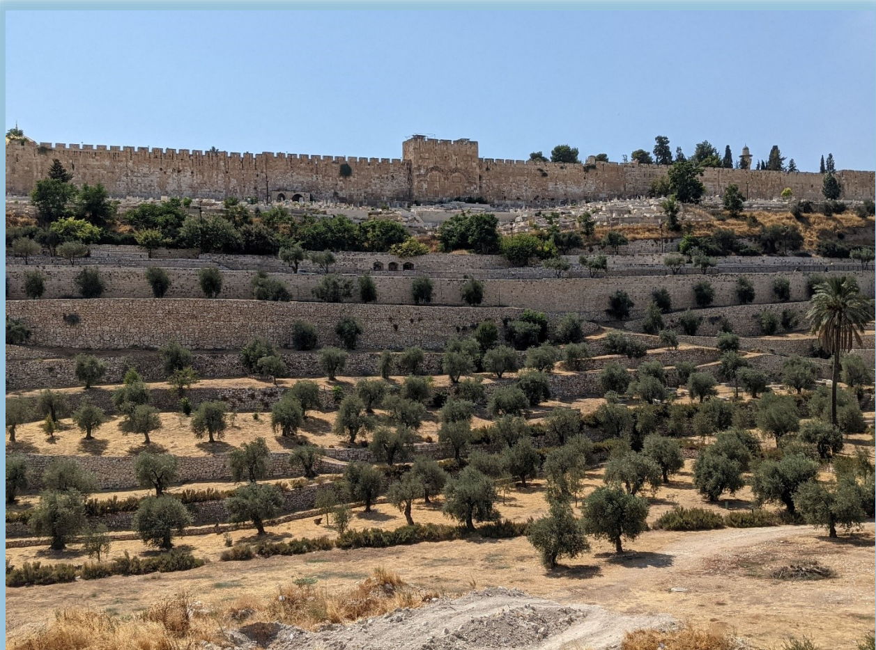
14:17 – This is the Kidron Valley where Melchizedek met Avraham Avinu. The city of Shalem was conquered by David Hamelech and renamed Yerushalayim. Above; Commemorating what occurred in this location. --- Below; the Kidron Valley is below the Eastern Wall of the Har Habayis (You can see Shushan Gate).