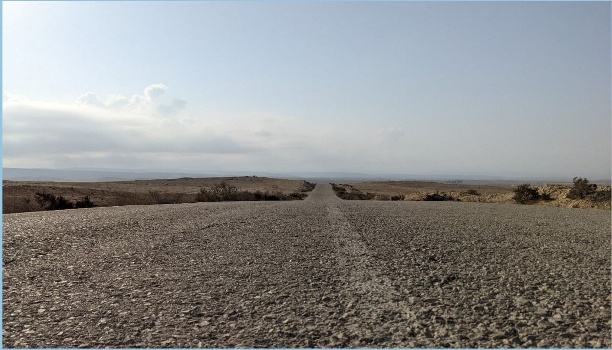
16:7 - Approximately in the area of “on the way to Shur”. This road leads to Shivta (about 25 miles south of Beer Sheva), which is near that ancient roadway.