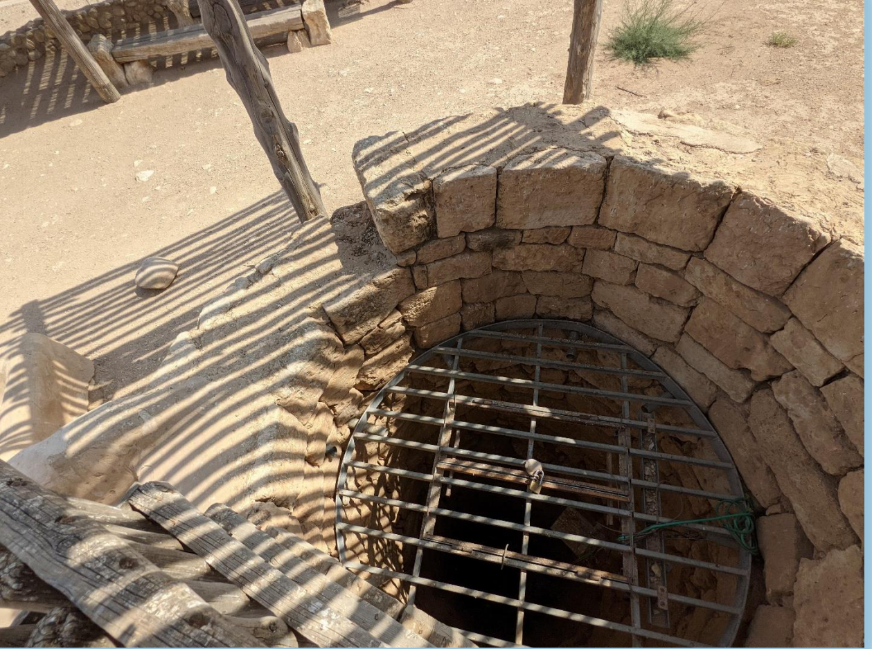
26:33 – The ancient well in Tel Be'er Sheva.