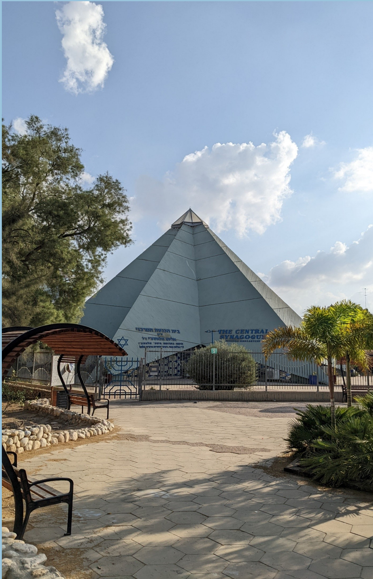
21:33 – A Shul in Be'er Sheva, designed to look like Avraham Avinu's Tent.