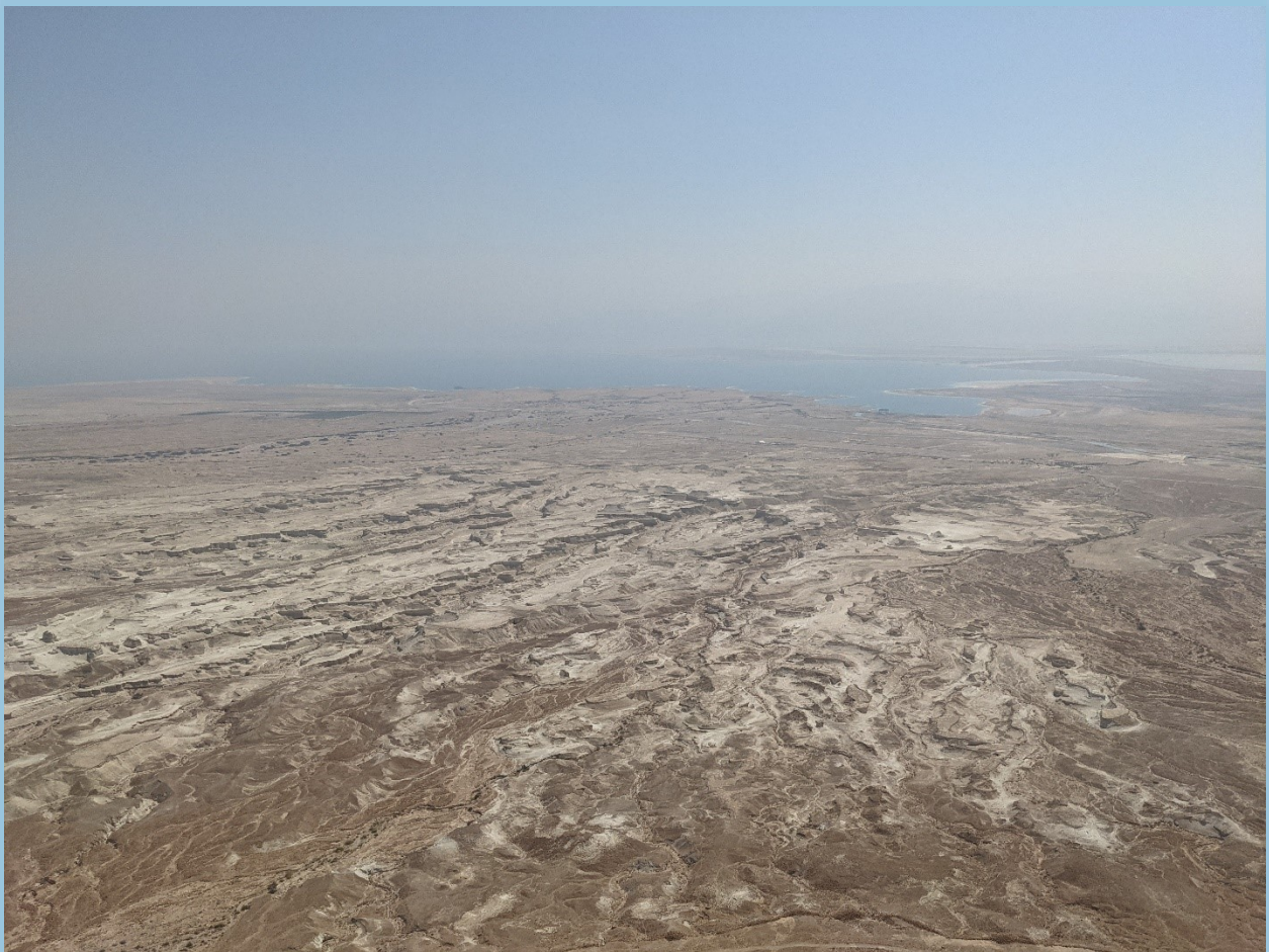
19:25 - View from Masada (the famous fortress where the Jews tried holding out against the Romans. It is about 30 miles southeast of Yerushalayim), overlooking the area of Sodom and Gomorrah. This area used to be lush with vegetation. However, because of the extreme destruction of Sodom and its neighboring cities, it is nearly impossible for nature to grow here.