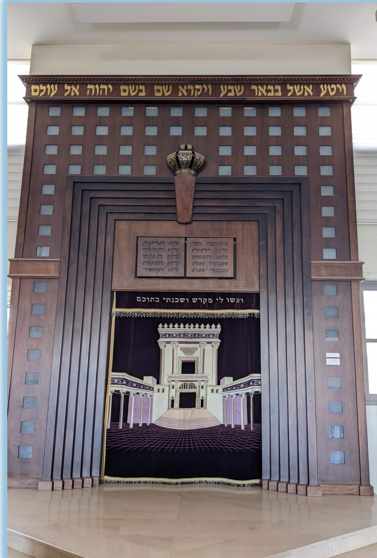
21:33 – The Chabad House in Be'er Sheva. This possuk is on top of the Aron Hakodesh.