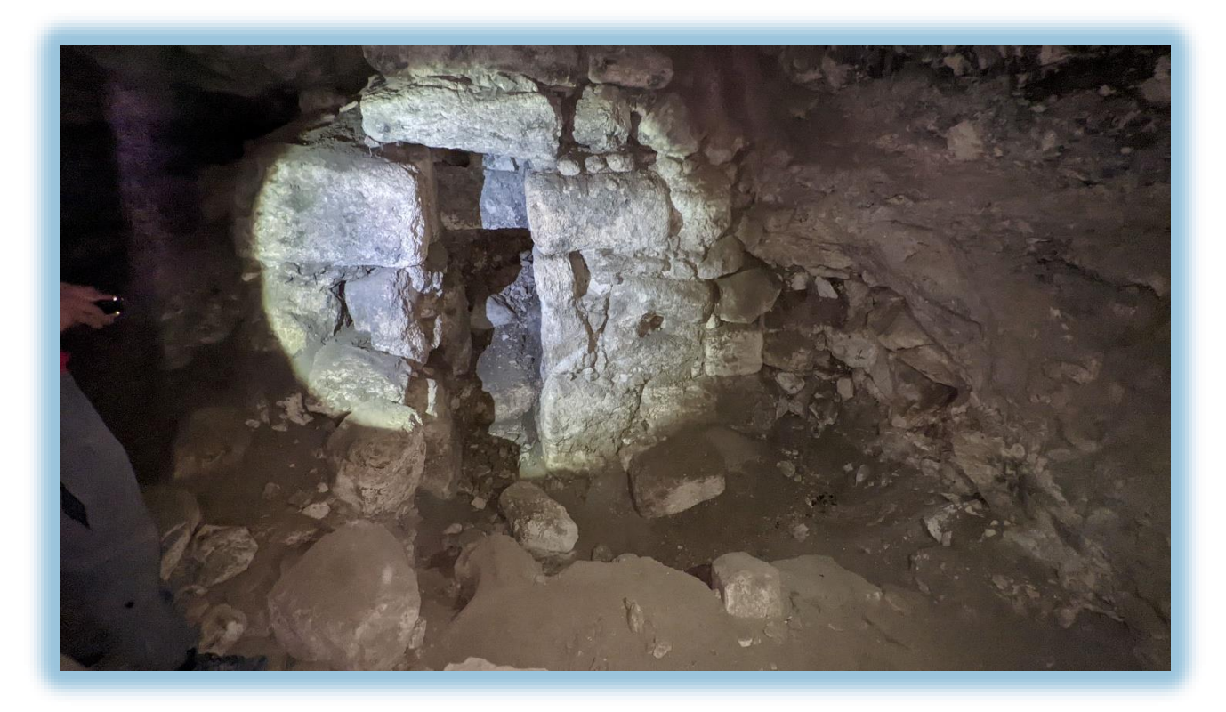
38:1 (Picture 2) — One of the most famous descendants of Yehudah was David HaMelech, who hid inside a cave by Adullam to escape Shaul HaMelech. This is a picture from inside one of the caves in Adullam.