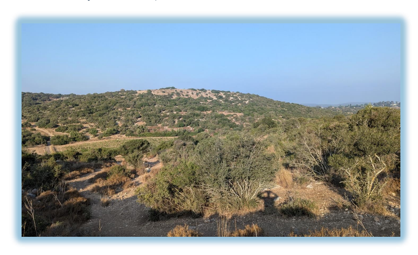
38:5 (Picture 2) — Today, there are many vineyards around the area of Keziv (about 5 miles south of Beit Shemesh).