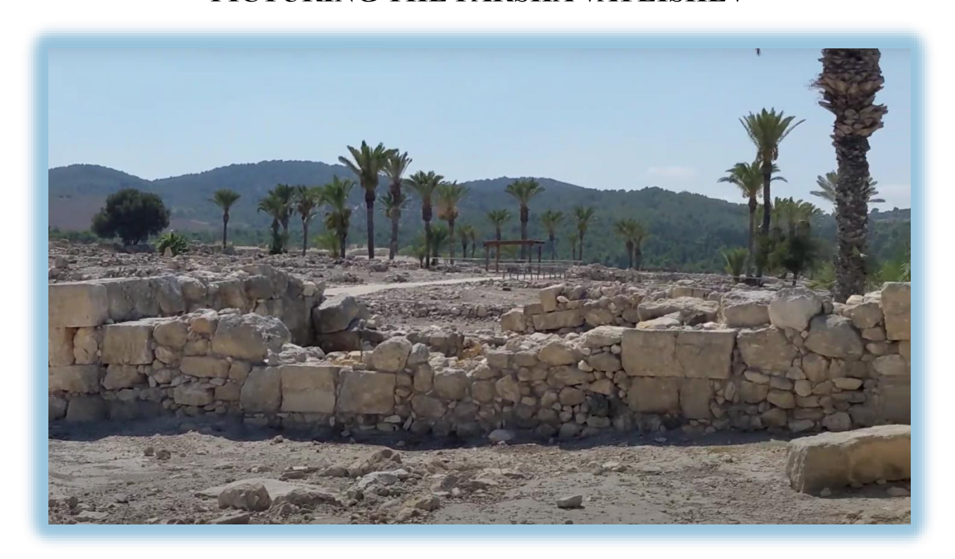
37:17 – Tel Megiddo (About 20 miles southeast of Haifa), is where the Egyptians fired an arrow that hit King Yoshiyahu, who was trying to stop them from passing by. About 11 miles southeast of Tel Megiddo, past those mountains in the background, is Dosan (that area is very dangerous to visit).