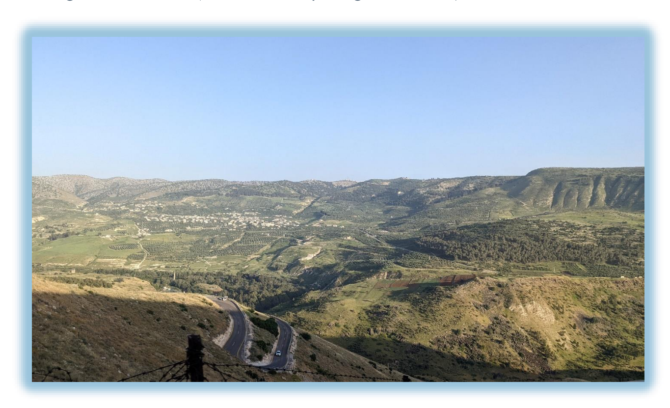
37:25 - I got a car ride from Tel Saki down to Tiveria. We drove by the south of the Golan Heights (about 9 miles southeast of Tiveria). The mountains in front of us, which are located in Jordan, is the Gilead Area.