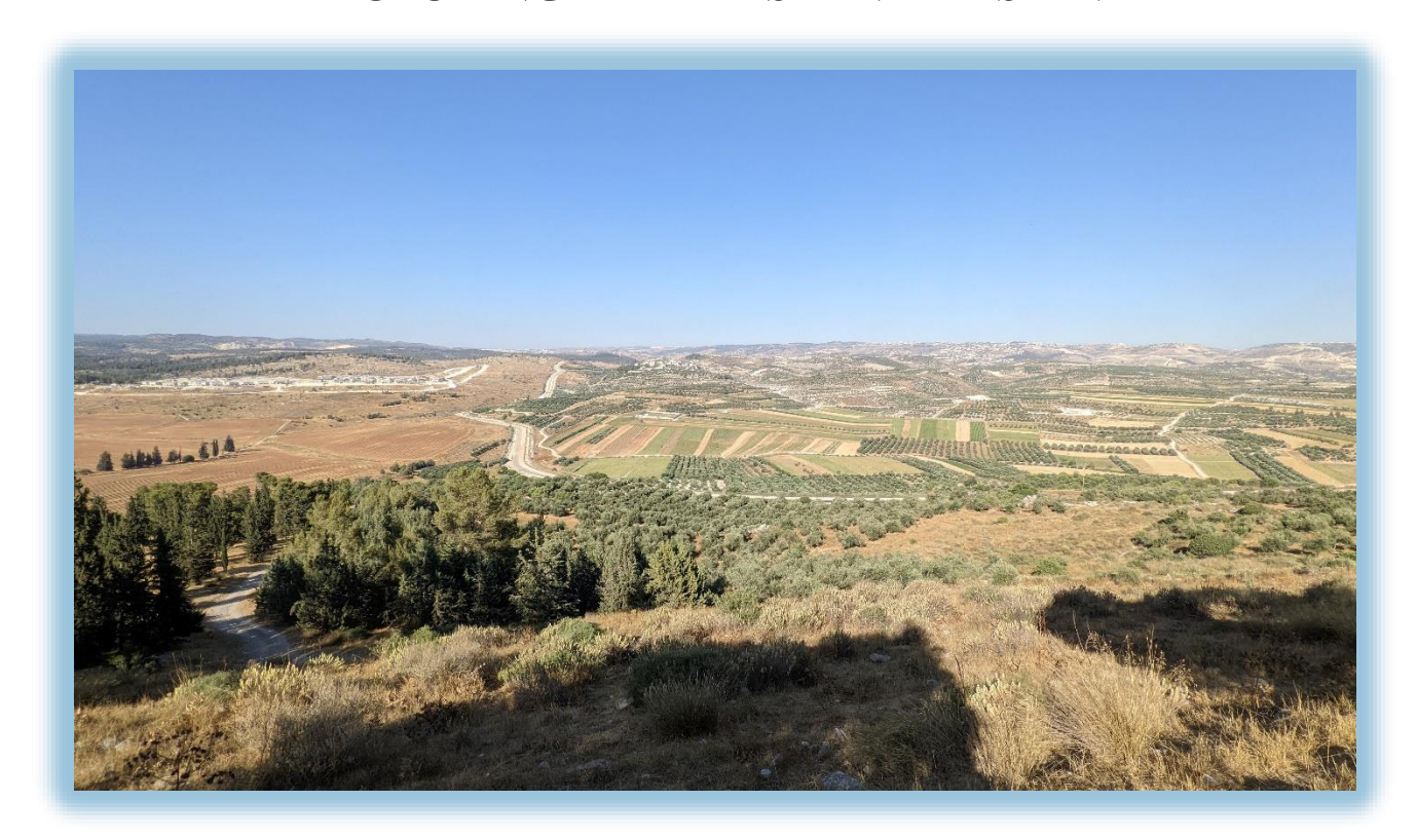
38:1 (Picture 1) – The view from Adullam overlooking the Chevron mountains (Chevron is about 10 miles southeast of Adullam).