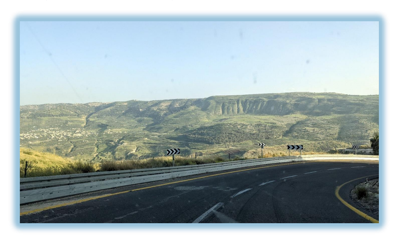
31:21 –(Picture 1).