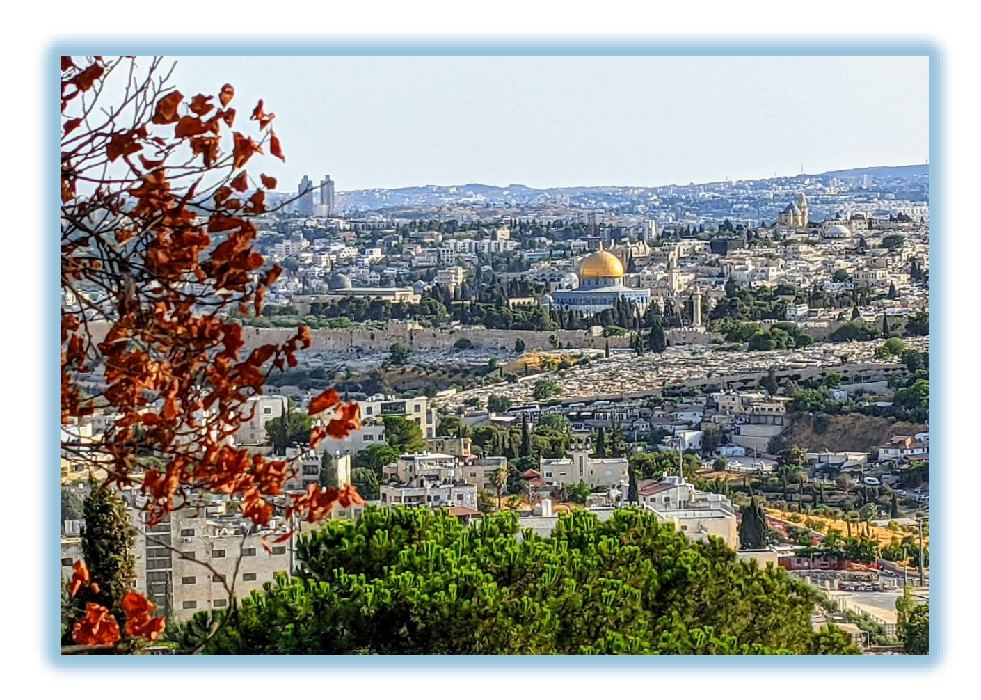
28:17 – Rashi talks about the Midrashim who say that the dream happened over Har Mariah. View of Har Mariah from Mount Scopus.