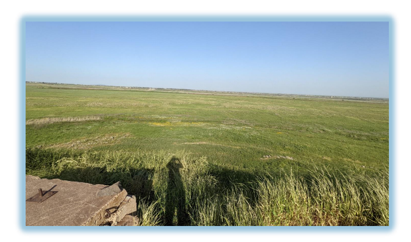
29:1 – View from Tel Saki (about 20 miles east of Tsfas) in the Golan Heights, overlooking the Syrian border, which is just 1 mile east of it (a crucial battle in the Yom Kipper War took place here). Yaakov Avinu likely walked past this area on his travel from Beit El to Aram Naharayim.